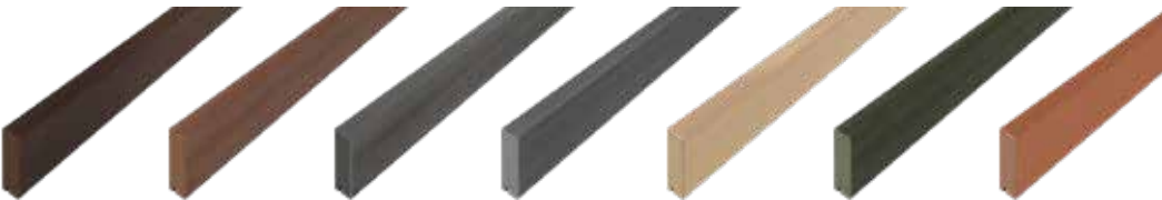
Fokus Chocolate Black Fokus Brown Fokus Grey Platin E cru Jade Umbra