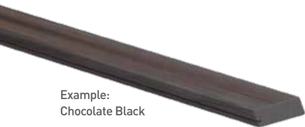
Example: Chocolate Black

The rhombus profile is available in seven colours. You will find the entire colour diversity on the opposite page.