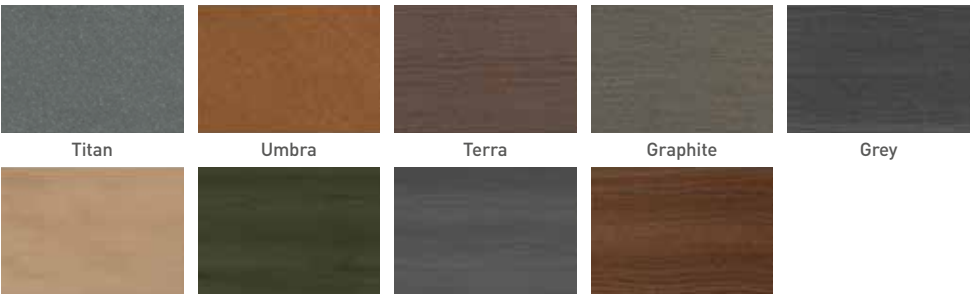
Titan Umbra Terra Graphite Grey E cru Jade Platin Brown